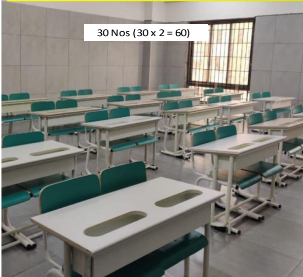
30 Nos (30 x 2 = 60)