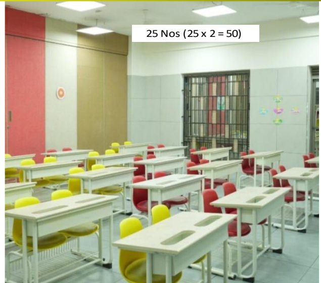
25 Nos (25 x 2 = 50)