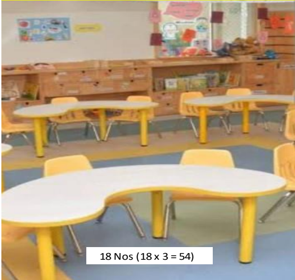
18 Nos (18 x 3 = 54)